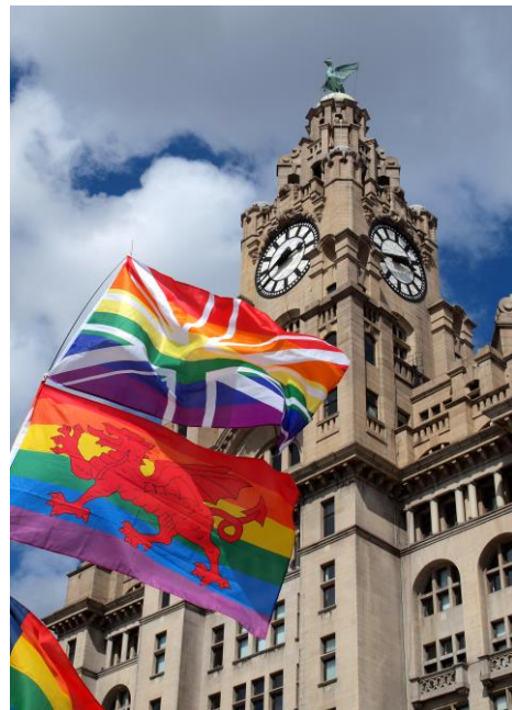
© Anna Fairley Neilsson, Liver Building and Pride Flags, 2013

* This is the figure provided by Stonewall , http://www.stonewall.org.uk/our-work/international-work-1 . Stonewall are the biggest organisation to campaign for equal rights for LGBT+ people and where the campaign for equal rights for LGBT+ people began.